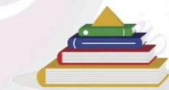
Egyptian Knowledge Bank بنك المعرفة المصري